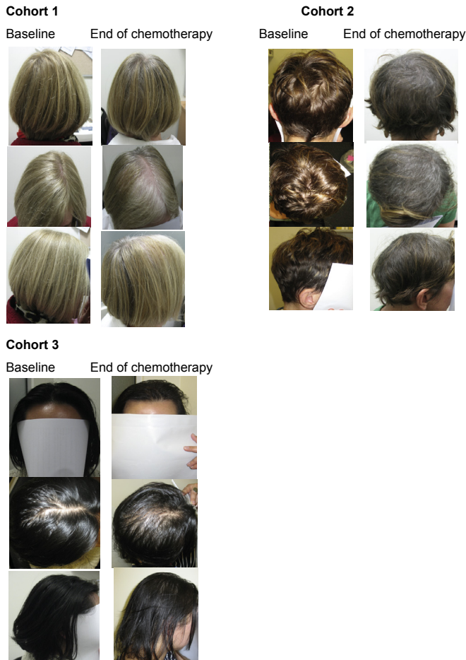
Fig. 2. Patients who reported minimal hair loss.

40%–45% of patients ceased SC in cohort 2 and 3, respectively (Table 1).